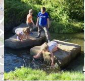
6 Stepping Stones