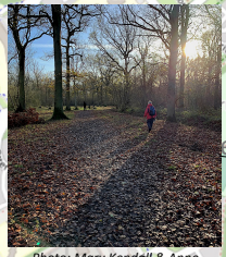
12 Shenley Wood