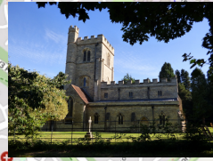
10 St Mary's Church