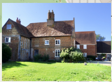
14 Milton Keynes Boundary Walk