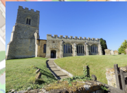
7 All Saints Church