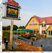
19 Prince George