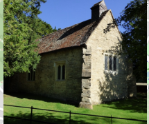
18 St Giles Church